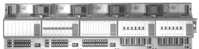
Fig. 2. CentraLine CLIO modules

See also LonWorks Bus I/O Modules – Product Data (EN0Z-0980GE51).